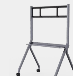
Mobile Stand (ST41B)