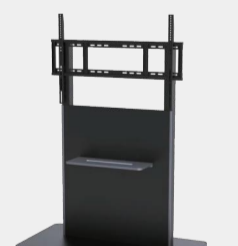
Mobile Stand (ST23C)