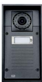
2N® Helios IP Force