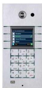
2N® Helios IP Vario

The 2N® Helios IP family is a wide range of door intercoms for every situation - whether in security, business, emergency, or any other special area. From providing simple applications requiring a clear and easy connection to a single IP telephone, to comprehensive communication arrangements integrated into security and signalling systems and IP PBXs. Having the highest quality and certification, 2N ensures compatibility with industry-standard-based IP network solutions such as Avaya, Cisco, and others.