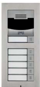
2N® Helios IP Verso