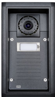
2N® Helios IP Force