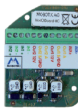
MxIOBoard-IC for signal input/output (accessories)