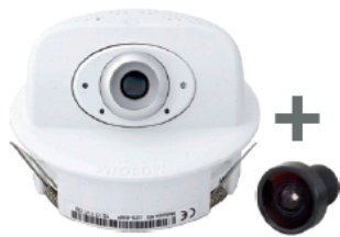
p26 camera body und lenses B036 to B237 for self-mounting