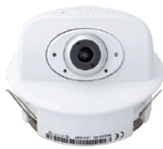
p26 camera, lens B016-B237