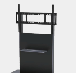
Mobile Stand (ST23C)